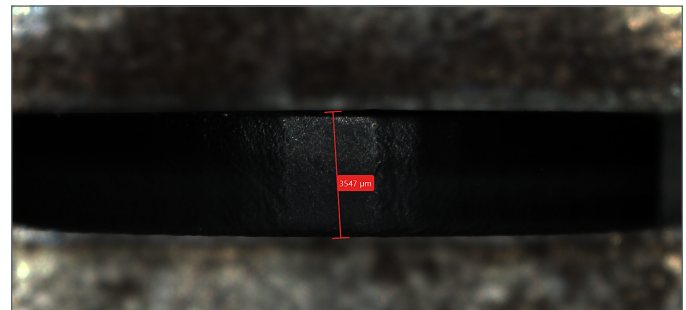
Inner edge of cut holes with 100 W, 10.2 \mu\text{m} wavelength CO 2 laser