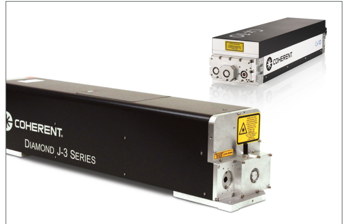
Coherent DIAMOND CO 2 lasers: J-3 (>225 W) and Cx-10 (>100 W)

CO 2 Laser Cutting of Polypropylene (PP) for automobile bumper covers.